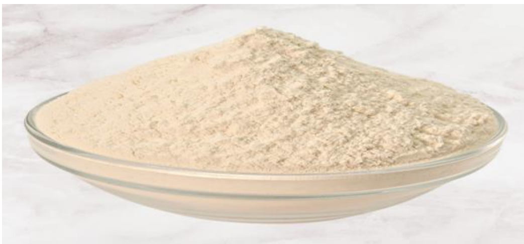
Figure 2: Xanthan Gum