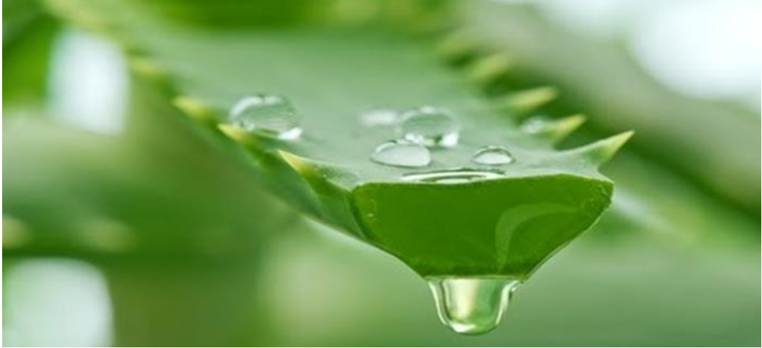
Figure 4 Aloe Mucilage