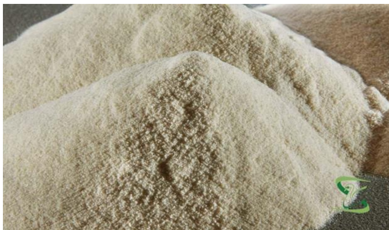
Figure 3 : Gum Agar