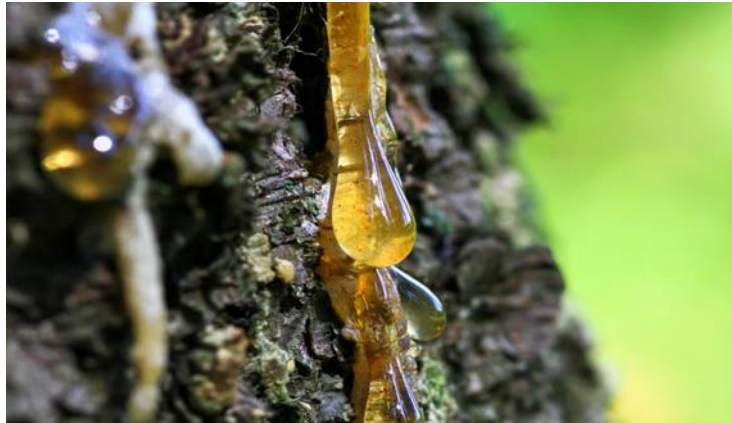
Figure 1: Neem Gum