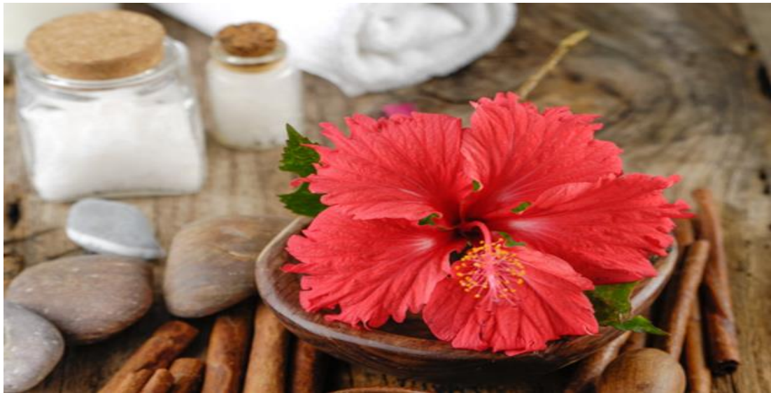
Figure 5: Hibiscus Mucilage